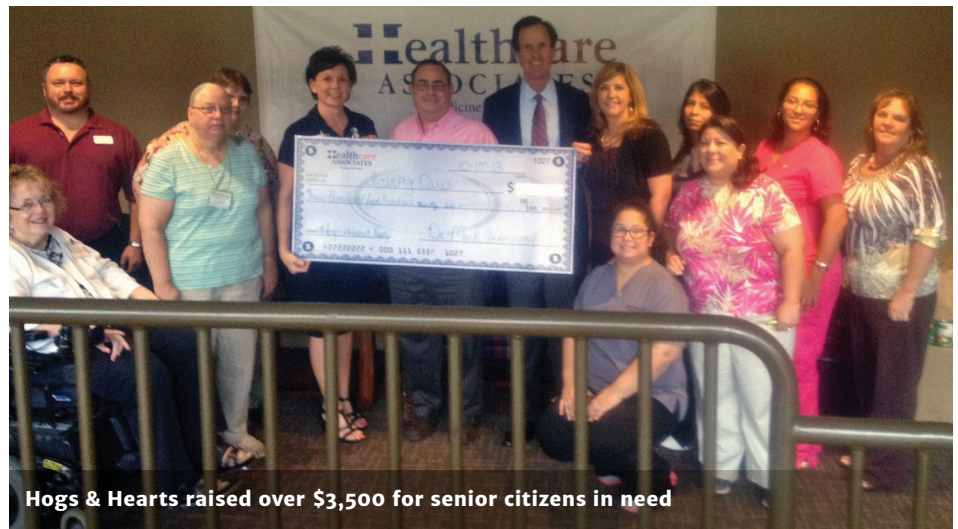
Hogs & Hearts raised over $3,500 for senior citizens in need